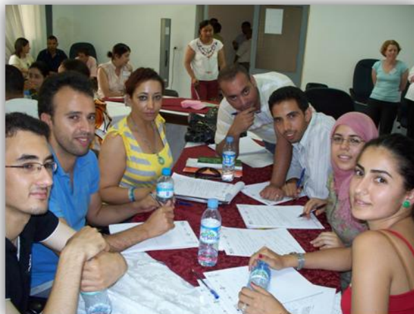
Participants to the Summer academy on Good Governance in the Maghreb Region, Marrakech, Morocco

The academy was held in Marrakech, Morocco, on June 28 – July 6, 2008, in cooperation with the European Inter University Center, the German Technical Agency (GTZ), the Arab Democracy Foundation, and the Faculty of Law at the Caddi Ayyad University in Marrakech.