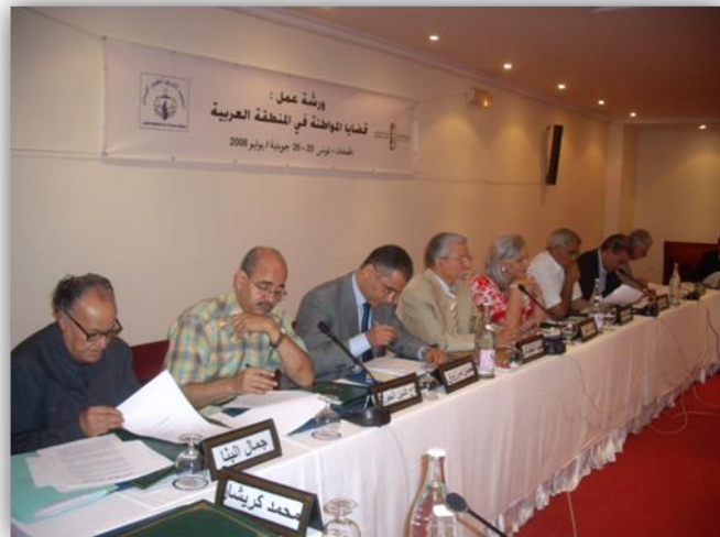
Representatives of Arab civil society taking part in the workshop “Building the Arab Citizenship Movement”, Hammamet, Tunisia

As part of the implementation of its project for the building of an Arab Citizenship Movement, Al Kawakibi Center organized a workshop aimed at creating a civil society alliance and drafting a “Call to Citizenship” in the Arab region. The workshop was held on July 25-26, 2008, in Hammamet, Tunisia in partnership with the Arab Institute for Human Rights and the Arab Democracy Foundation, and with the participation of Arab civil society representatives, media experts and intellectuals representing various trends and ideologies. Participants were involved in drafting the “Call to Citizenship”, in developing the regional plan for launching the citizenship campaign, and in developing the media plan for the citizenship campaign.