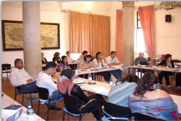
Participants to the training session on “Democracy and Good Governance in the Arab region”, Venice, Italy